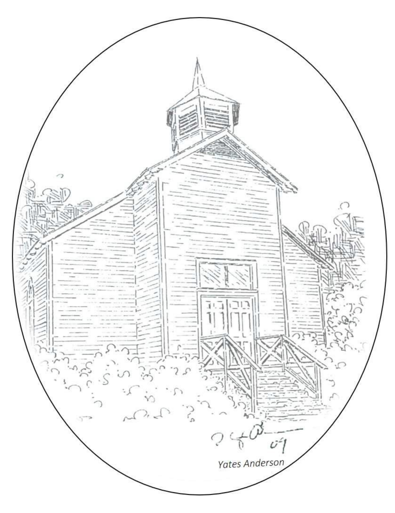
Lake Toxarvay United Methodist Church Sunday, February 4<sup>th</sup>, 2024